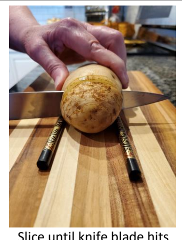
Slice until knife blade hits the chopsticks