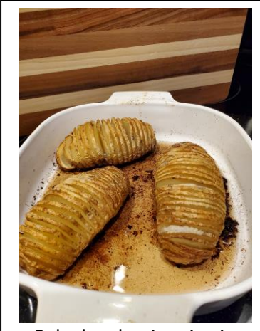
Baked and swimming in butter!