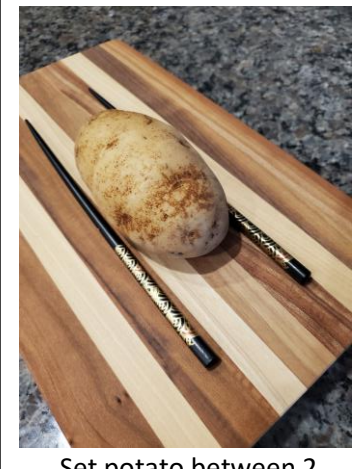
Set potato between 2 chopsticks