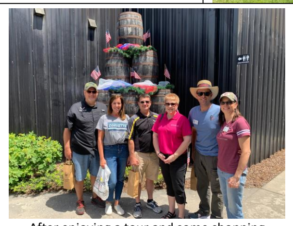
After enjoying a tour and some shopping